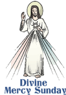
Divine Mercy Sunday